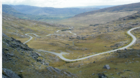
The incredible Moll's Gap awaits

Of course, we never rest on our laurels, and to give something back to those members who have given us so much, we'd love to show you just how much fun you're going to have on our MINIs Touring Ireland event.