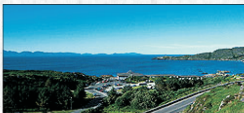
One of Kerry's scenic roads

MTI is a three day event, based in Ireland, the natural habitat of the MINI. While there are a few rules to adhere to during the event, there is one rule you must remember above all else: You are to enjoy yourself!