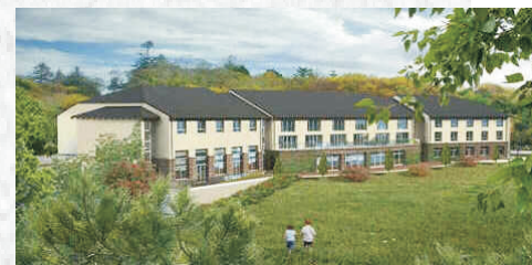
An Artist's impression of the new Sneem Hotel

Don't forget to join the discussions @ miniclub.ie !